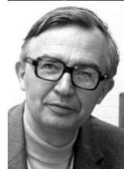
Jean-Marie Lehn Nobel Laureate in Chemistry