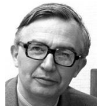
Jean-Marie Lehn Nobel Laureate in Chemistry